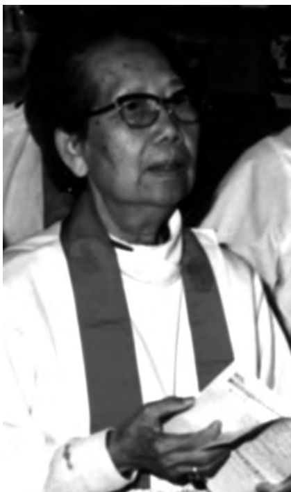
14. Florence Lei Tim-Oi, first woman priest of the Anglican Communion at a 1987 service on her 80th birthday

The following January he ordained her priest, writing to Temple: ‘I have had an amazing feeling of quiet conviction about this – as if it was how God wanted it to happen rather than a formal regularisation first.’ Although Temple did not have any theoretical objection to the ordination of women, he condemned the action as ‘contrary to the laws and precedents of the church’. Despite being given unanimous approval by her diocesan synod, Tim-Oi surrendered her licence after the war without resigning her orders. Lambeth 1948 declined to allow other deaconesses to be ordained priest. Nevertheless, the precedent had been set: it was possible for provinces to ordain women unilaterally.