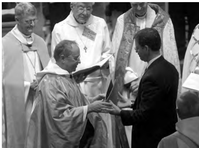
16. Bishop Gene Robinson, the first openly homosexual bishop in the Anglican Communion, receiving his Mitre from his partner

rather than a provincial or international matter: the impact on the global communion was not considered crucial compared with the right of the diocese to act alone. The old political doctrine of ‘states’ rights’ had won against ‘federal’ Anglicanism.