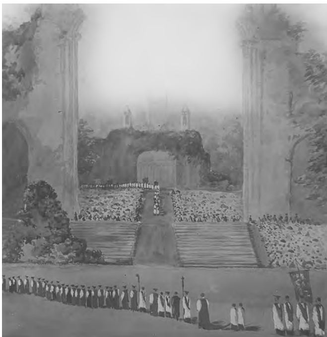
1. Procession of Anglican bishops at Glastonbury, 1897