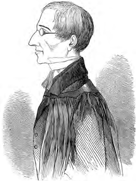
THE REV. MR. NEWMAN.

The doctrine of ministry and sacraments became central to the teachings of the Oxford Movement. Shortly after the Assize sermon, Newman (Figure 10) published the first of the Tracts for the Times (hence the alternative name 'Tractarian').